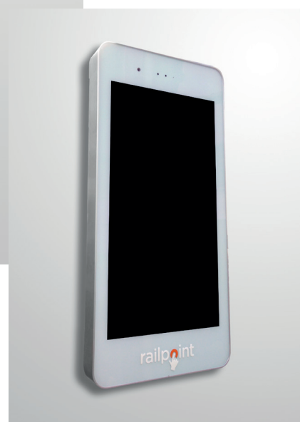
Also available in White